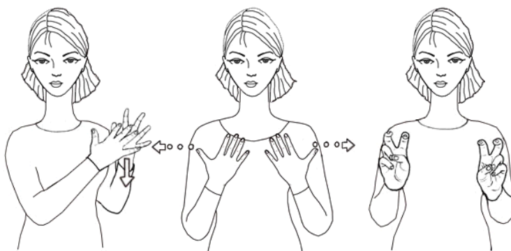
Fig. 1. The sign for “agricultural” in GESL.

Signs with meaning – MS (meaningful sign). These are the signs with lexical content (like