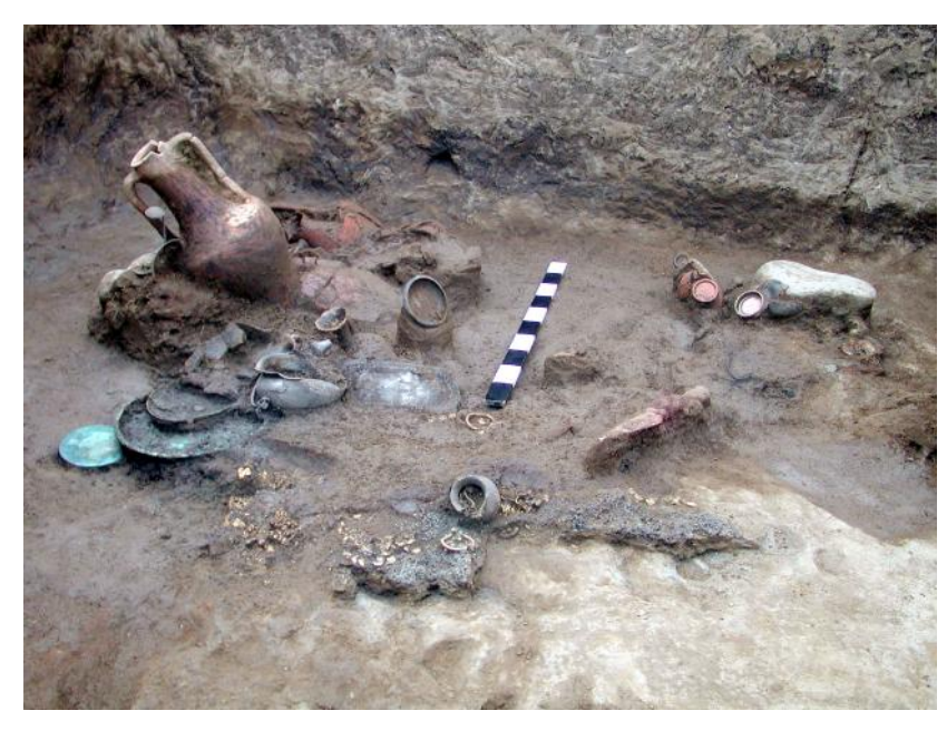
Fig. 1. Vani Site. View of grave 24.