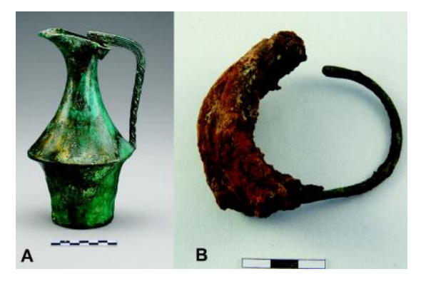
Fig. 2. Vani site. Grave 24, A - oenochoe; B - bracelet.

Great quantity of pollen grains was found in both samples. More than 500 pollen grains were counted on a half part of each slide. Pollen grains of chestnut ( Castanea sativa ) and lime ( Tilia ) prevailed among arboreal plants (Fig. 3). Pollen grains of maple ( Acer ), azalea ( Rhododendron luteum ), grapevine ( Vitis vinifera ), and hazel ( Corylus avellana ) were identified in considerable amounts. Separate pollen grains of oak ( Quercus ), alder ( Alnus ), walnut ( Juglans regia ), pine ( Pinus ), elm ( Ulmus ), willow ( Salix ), buck-